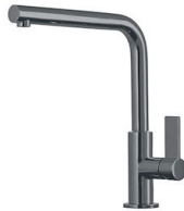
VERONA GUN METAL R497 S56