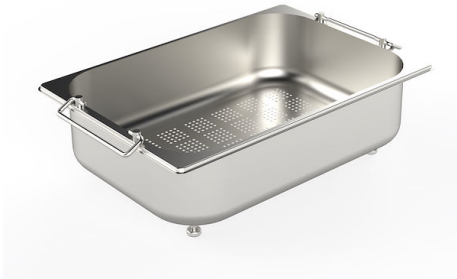
CUVETTE PERFOREE INOX