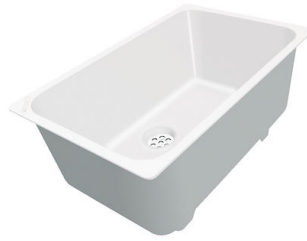
CUVETTE PLASTIQUE BLANCHE

* only in combination with the accessory A644 F04