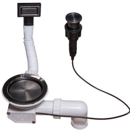
VIDAGE FADE PUSH GUN METAL A407 A20