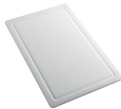
PLANCHE DE DECOUPE HDPE 27x42 CM