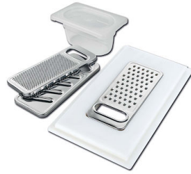
KIT RÂPES ET PLANCHE DE DECOUPE HDPE A159 A01 * only in combination with the accessory A644 A01