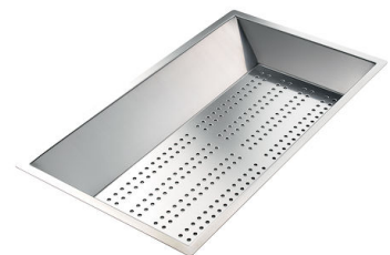
CUVETTE INOX PERFOREE